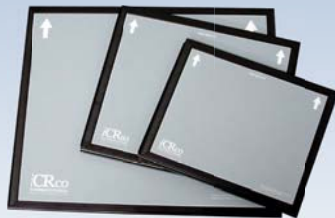
iCR Flat Scan Path™ IP Cassettes