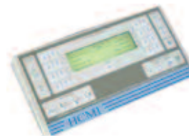
HF-30 Console with optional AP

Ideal for the budget minded practice, the HF-30 uses 20 kHz high frequency technology and provides full 30 kW power for general radiographic needs. The operator friendly console provides fast 2-point technique selection. An optional anatomical programming mode offers consistent, effortless images by fast, automatic technique selection.