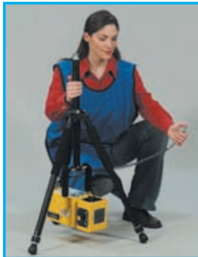
HF8015+dlp shown here in low position on X100S tripod stand.