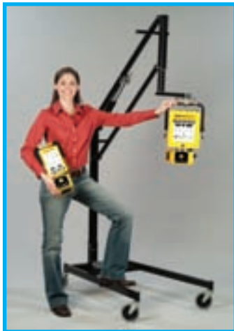
Also for equine use is the HF100/30+ and 300GS Mobile Stand seen above.

MinXray's full-wave rectified high frequency units are the most efficient portable x-ray generators in the world. Conventional units (self rectified, line frequency) are only about one-third as efficient as these technologically advanced units. Therefore, considerably more radiation output per pound of system weight is available from the MinXray HF designs. As an added benefit, the output of these units is independent of line voltage variations... a very important feature for field use.