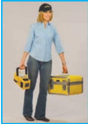
Unit comes with a sturdy carrying case.