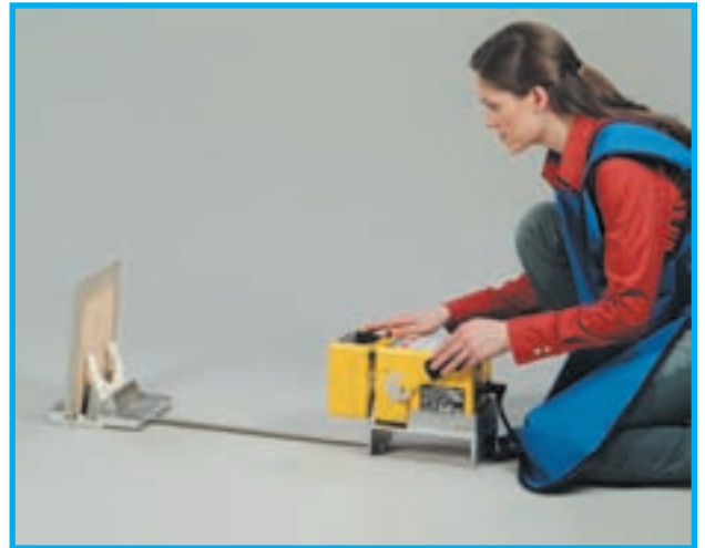
HF8015+dlp shown with EFB15 Redden Equine Foot Block for consistent hoof imaging.